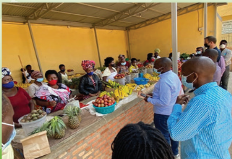
A women group managed selling point supported by HortInvest in Rutsiro

HortInvest has worked closely with the national government and district mayors' offices to promote the horticulture sector in Rwanda. Specifically, HortInvest has supported the Government of Rwanda's pest products control strategy, and contributed to the Rwanda Horticulture Working Group (RHWG) and Rwanda Potato Sector Platform (RPSP), as well as district level horticulture platforms in Rubavu and Karongi district. In partnership with district GoR offices, HortInvest has also set up selling points in each of its working districts and washing centers which enable women traders to market their produce more easily.